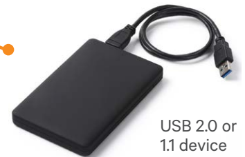
USB 2.0 or 1.1 device