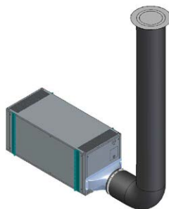
Heat rejection duct kit

The highly flexible Vertiv VRC easily accommodates the many different site challenges presented by small IT spaces. It can be installed to reject heat to the ceiling or an adjacent space.