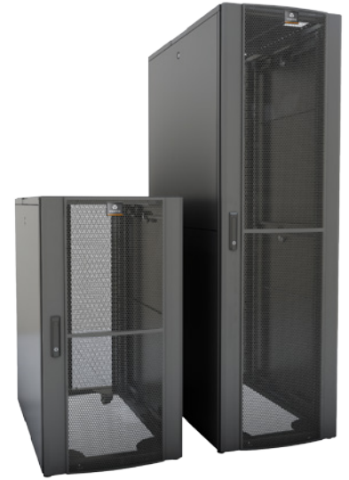
DCF Rack 24U