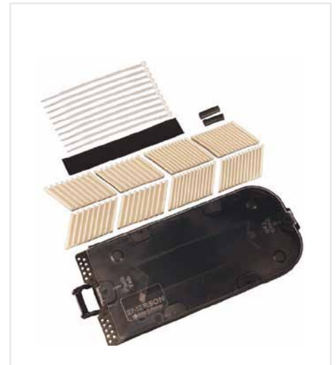
Universal Splice Tray