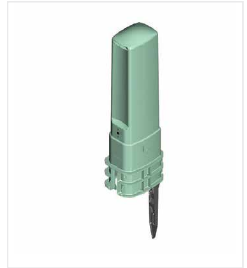
Short Self-Supporting Base Shown with Snap-On Stake