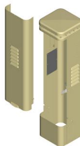
Wall Mount Pedestal (MCAD12-MF)