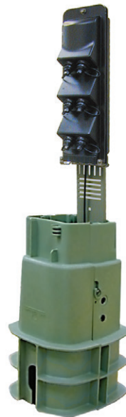
8-in. Fiber Pedestal

Vertiv BBE PRO Series pedestals are ideal for applications where non-metallic construction, flood protection, or 360° access is desired. These pedestals are designed for optical terminal blocks in buried distribution FTTH applications.