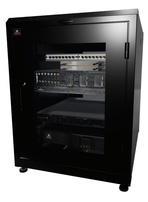
Figure 2: Vertiv's SmartCabinet for Branches provides a turnkey IT support system that speeds deployment and supports standardization.