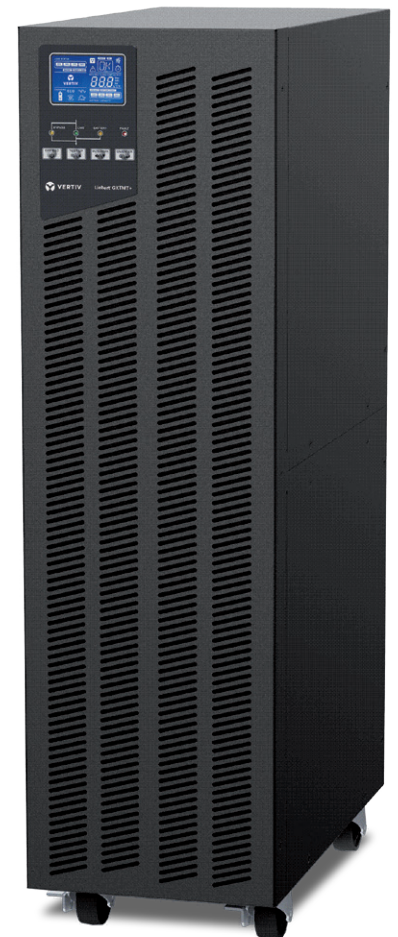
Liebert GXT MT+ 6 kVA - 10 kVA Tower