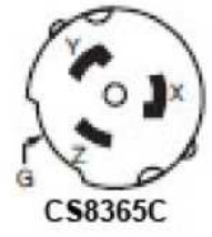
CS8365C (50 A, 3/PE, 200-240 V)