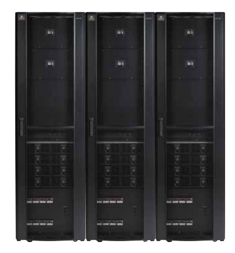
NetSure 9500 400V DC Power System Main Power Module (left) and Expansion Power Modules (middle and right)

NetSure 400V DC to -48V DC converter systems can also be used to extend the copper reduction benefits of 400V DC to existing -48V DC networking loads in core telecom applications.