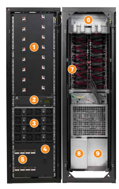
NetSure™ 9500 Main Power Bay with Integrated Load Distribution Panel