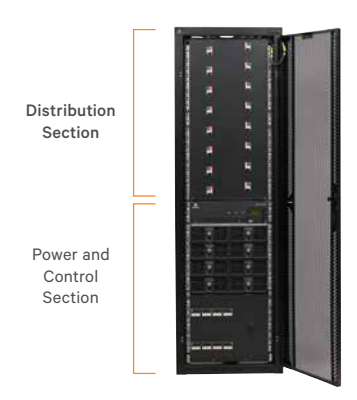
NetSure<sup>™</sup> 9500 Main Power Module with Integrated Load Distribution Panel