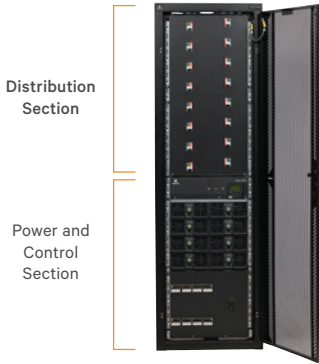
NetSure™ 9500 Main Power Module with Integrated Load Distribution Panel