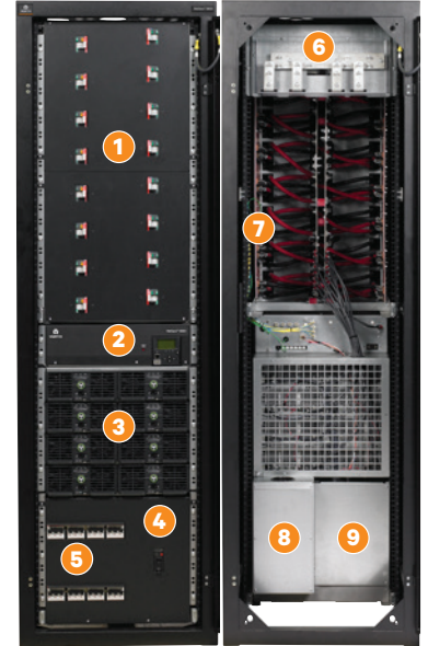
NetSure™ 9500 Main Power Bay with Integrated Load Distribution Panel