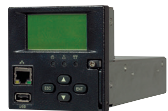
NetSure™ ACU+ Controller

The NetSure 9500 has several maintainability and redundancy features built into the controls section. The modular ACU+ controller is hot-swappable, allowing for field replacement or upgrade and the entire controls section can be removed from an operating system for replacement or repair without disturbing the output bus. Additionally, redundant power supplies are provided to ensure maximum uptime of this sub-system.