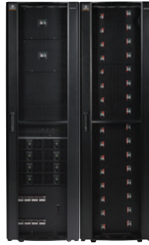
NetSure 9500 Power Module with Integrated Bulk Distribution Panels feeding a Load Distribution Module