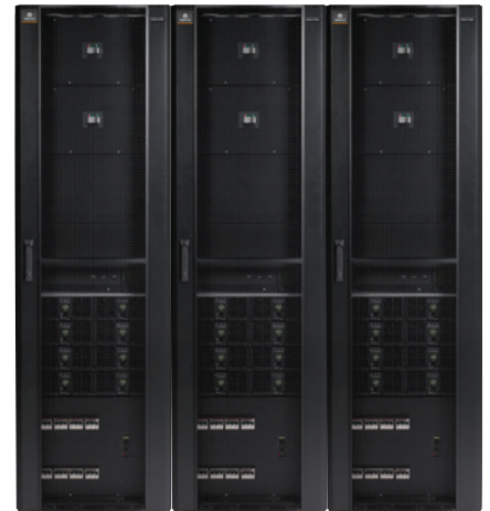
NetSure 9500 400V DC Power System Main Power Module (left) and Expansion Power Modules (middle and right)

NetSure 400V DC to -48V DC converter systems can also be used to extend the copper reduction benefits of 400V DC to existing -48V DC networking loads in core telecom applications.