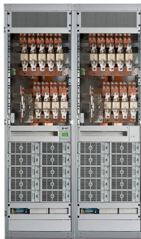
NetSure 801 Series Semi-Bulk System with 2 Cabinets