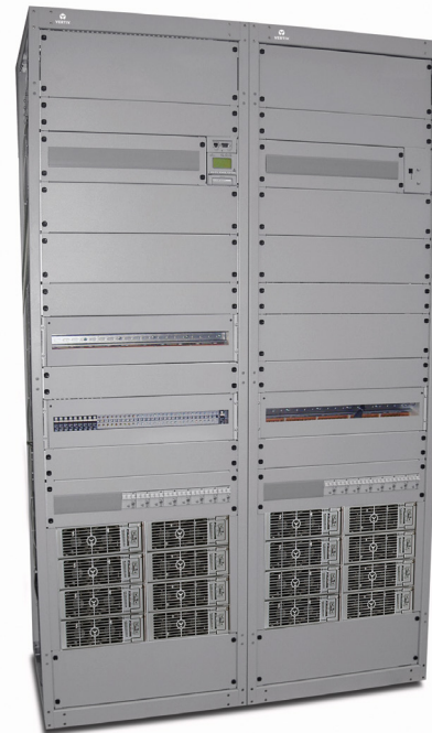
NetSure™ 801 Series Distributed System with 2 Cabinets