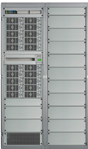
NetSure 801 Series Bulk System with 2 Cabinets

The bulk concept is especially well suited for replacing large old power systems at existing sites. It is the perfect way to upgrade your site, optimize room space, increase reliability and decrease power consumption (OPEX savings). Live system expandability allows appropriate investments (CAPEX savings) in accordance with present and future needs.