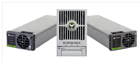
High-Efficiency eSure™ Rectifiers R48-3500e3 (left) R48-3500e (center) & R48-2000e3 (right)

The NetSure 7100 system is ideal for wireless, and wireline applications, including cell sites, MTSOs, small COs, datacenters, co-locations, huts, vaults and enclosures.