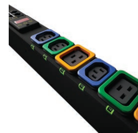
Vertiv Geist™ Switched Rack PDU