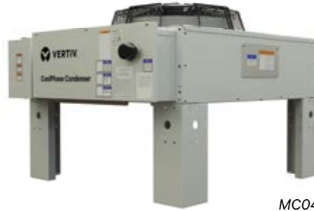
MC040 One-Fan Microchannel Coil Condenser