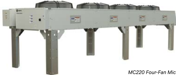
MC220 Four-Fan Microchannel Coil Condenser

The Vertiv™ CoolPhase Condenser is an air-cooled condenser designed to deliver energy efficiency.