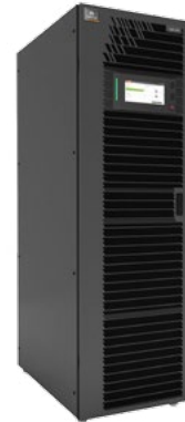
Liebert EXM™ UPS 10 - 250kVA