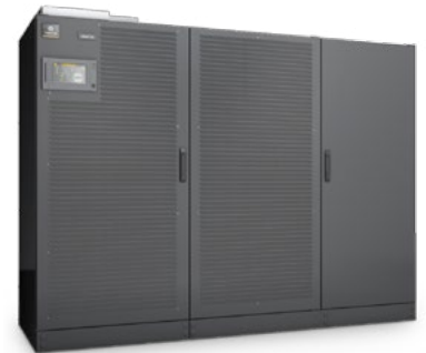
Liebert EXL™ S1 UPS 625 - 1200kVA/kW

VertivCo.com | Vertiv Headquarters, 1050 Dearborn Drive, Columbus, OH, 43085, USA