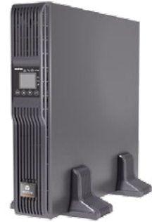
Liebert® GXT4™ UPS 500 - 10,000VA