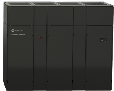
100-160 kW Frame 10