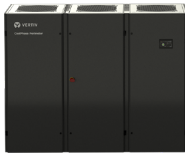
60-100 kW Frame 5