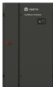
30-45 kW Frame 2