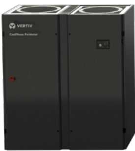
45-60 kW Frame 3