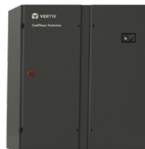
45-60 kW Frame 3