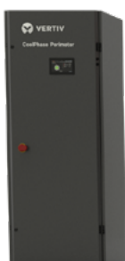
0-15 kW Frame 0