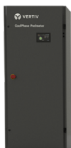
15-30 kW Frame 1