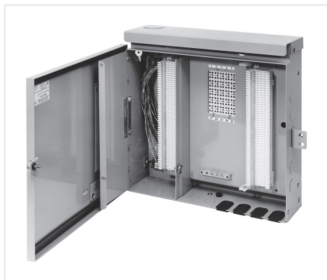
BEPC25C (25-pair) Quick-Clip In & Out