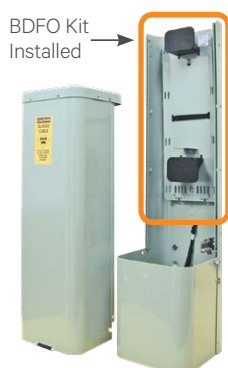
Vertiv™ BBE BD Series BDFO Fiber Splice Kit