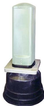
Vertiv BBE PRO Vault Series