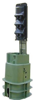
Vertiv BBE PRO URB Series

Our diverse line of pedestals can be used in a wide variety of fiber optic applications.