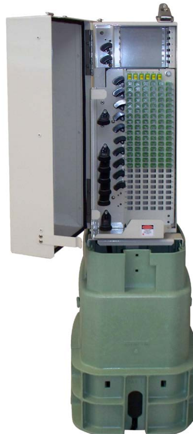
Vertiv BBE FDH Compact Series Integrated Fiber Distribution Hub Solution

Vertiv offers a comprehensive line of Vertiv™ BBE Integrated Solutions pre-configured for FTTx deployment.