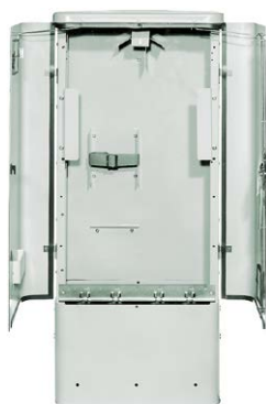
Vertiv™ BBE OPFO Series Splice Closures