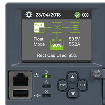
NetSure™ Control Unit User Interface