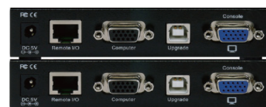
VPX300T / VPX300R Unit Rear Panels