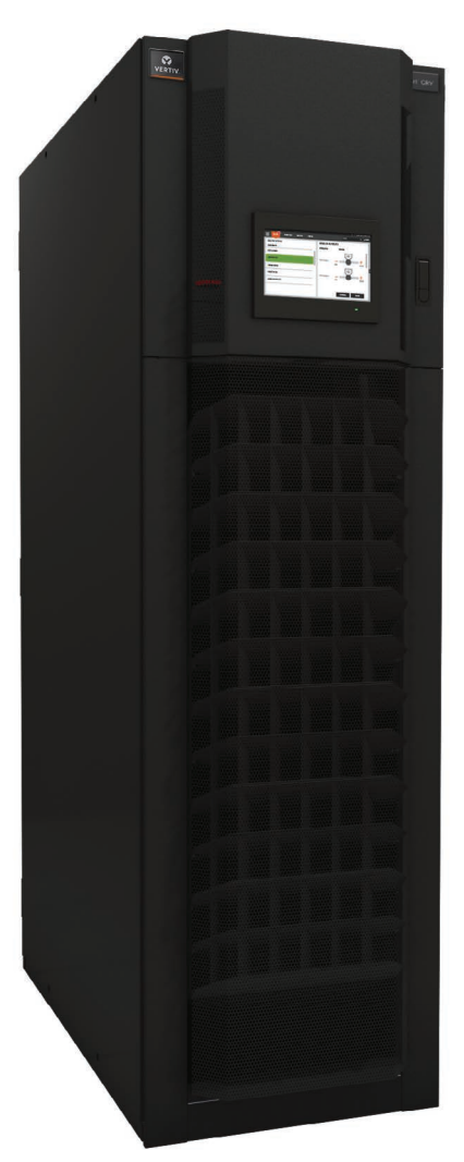
Vertiv™ Liebert® CRV 600mm

The unit also allows ease of installation, through simplified cable and pipes routing from top and bottom of the unit.