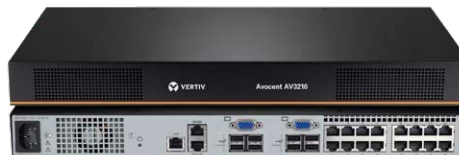
AV3216: Vertiv™ Avocent® AutoView™ 32-port switch