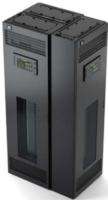
Triple: 603 mm x 932 mm (24" x 37") | 252pole | 250/400 A