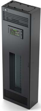
Single: 328 mm x 603 mm (13" x 24") | 84pole | 250/400 A

The flexible Vertiv™ Liebert® RXA is easily configured to accommodate current site needs and future growth.