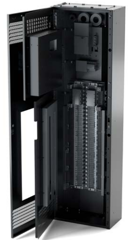
Figure 2. Vertiv™ Liebert® RXA (internal view)