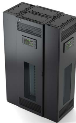
Quadruple: 603 mm x 1260 mm (24" x 50") | 336pole | 250/400 A