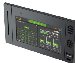
Figure 1. Front 9" touch screen coloured display with visible and audible alarms to prevent downtime

The display's frame includes LED and speakers with alarms for faults or warnings, all easily programmable: