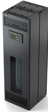
Double: 603 mm x 603 mm (24" x 24") | 168pole | 250/400 A