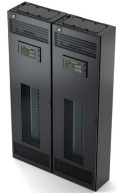
Double: 328 mm x 1207 mm (13" x 48") | 168pole | 250/400 A