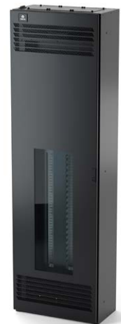
Figure 3. Vertiv™ Liebert® RXA without Vertiv™ Liebert® DPM monitoring system