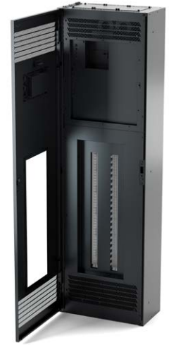
Figure 1. Vertiv™ Liebert® RXA (second access door view)

*Not included in the Liebert RXA model without a monitoring system