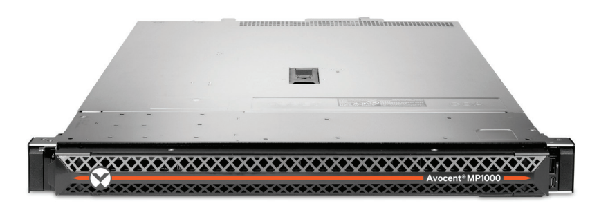
Avocent® MP1000 Management Platform (Hardware or Virtual Appliance)

Demand for data center resources is growing, but particularly edge computing. Gone are the days of centralized core applications. Instead, organizations are leveraging cloud and edge computing to power digital business applications, optimize the processing of data-intensive workloads and create real-time analytics.