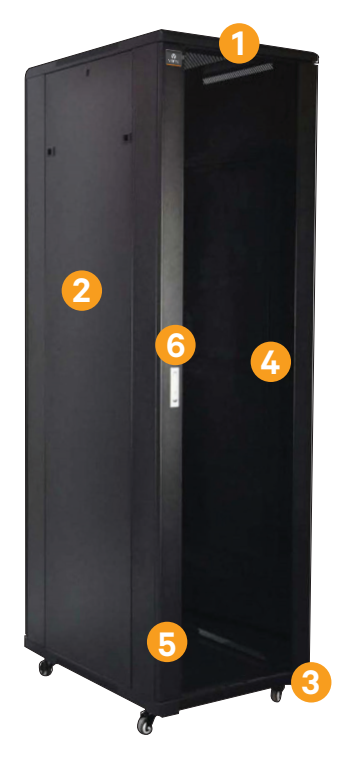
24U, 42U and 47U Sizes (Other dimensions available upon request.)