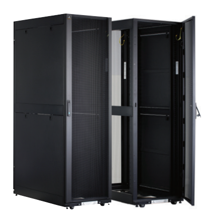
S-27 Series 42U, 45U and 48U Sizes

The S-Series Rack is an innovative enclosure system that integrates your computing hardware, power management technologies and peripherals in your data centres and computer rooms. It gives superior design and flexibility, allowing optimal data centre performance and easy installation.