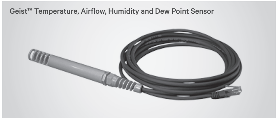
Geist™ Temperature, Airflow, Humidity and Dew Point Sensor

Once connected, the Geist environmental monitoring device automatically detects and identifies the sensor.