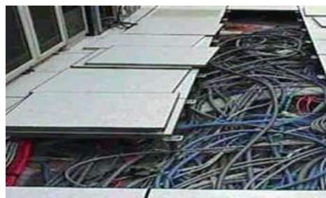
Typical data center with power cables and conduit