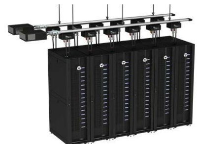
Data center with Vertiv™ PowerBar iMPB