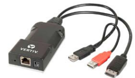
Avocent HMX 5150 Dongle

Vertiv.com | Vertiv Headquarters, 1050 Dearborn Drive, Columbus, OH, 43085, USA