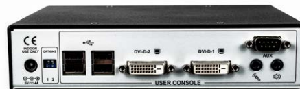
Avocent HMX 6200R