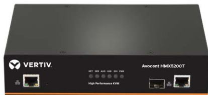
Avocent HMX 5200T