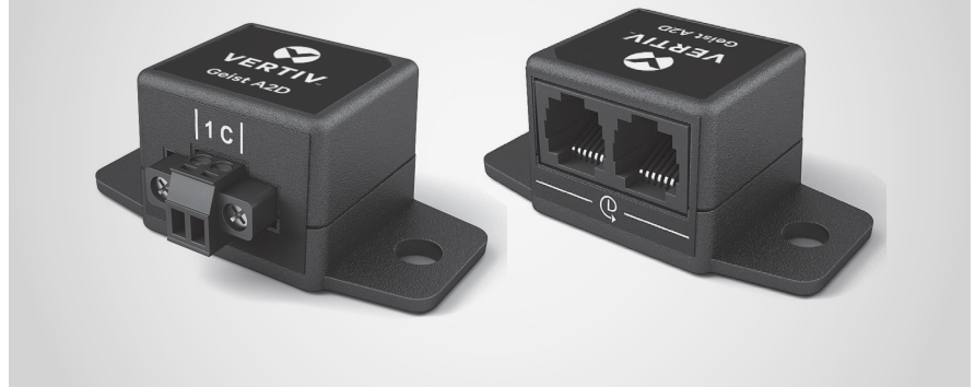
Typical Daisy Chain Configuration of the A2D Converter