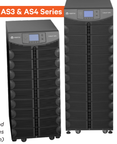
20 kVA, 16 Bay, Xfmr-based 17.3 W x 33.5 D x 48.8 H inches (440 W x 850 D x 1240 H mm)

15 kVA, 12 Bay, Xfmr-based 17.3 W x 31.5 D x 41.7 H inches (440 W x 800 D x 1060 H mm)