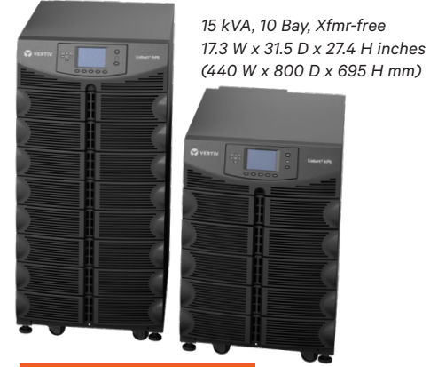
AS5 & AS6 Series

20 kVA, 16 Bay, Xfmr-free 17.3 W x 33.5 D x 38.2 H inches (440 W x 850 D x 970 H mm)