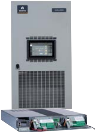
Kit for primary bay with door and chassis