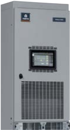
Upgraded primary bay

Upgrade aging controls in legacy Vertiv™ NetSure™ 802 systems without service disruption, adding a modernized local/remote interface with enhanced security features.