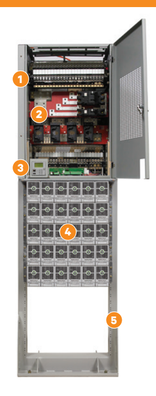
NetSure 7100 with 400 VDC Input