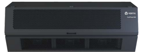
Vertiv™ CoolPhase Wall: Indoor Unit