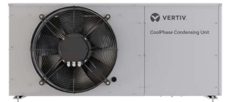
Vertiv™ CoolPhase Condensing Unit