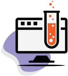
Computer engineering labs

Staff who need secure remote access to 4K streaming and video imagery while using on-premises business applications work at: