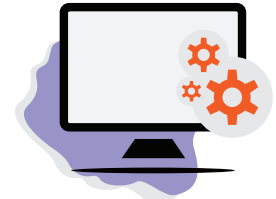
Software R&D development firms