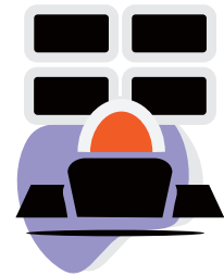
Industries with control rooms (power grid)