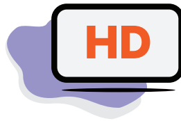
High-resolution display manufacturers