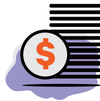
Financial services firms (trading, trade auditing)