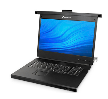
Certifications: TAA compliant, UL, CE, CCC, BSMI, RCM, cUL, IC, EAC, VCCI, KCC FCC Class A.

The Avocent® LCD LRA Console family provides the simplicity, efficiency and ease of use to make it the perfect in data center access point. The LRA line enables ease of access to multiple servers making software upgrades, troubleshooting, and system monitoring convenient and less time-consuming.