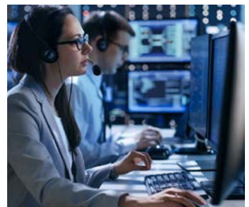
Support Services for Critical Facilities

From maintenance to replacements, you can count on Vertiv to keep your energy storage working for you.