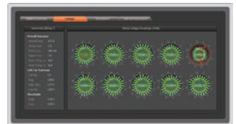
Vertiv™ Albér™ Battery Xplorer Enterprise