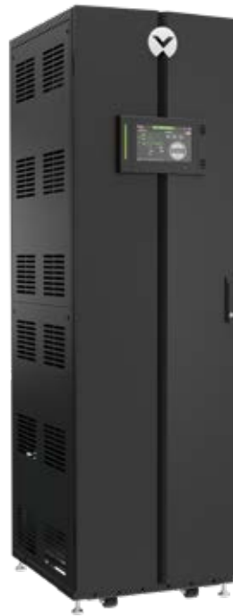
Vertiv™ EnergyCore Battery Cabinet

The cabinet has successfully passed UL 9540A thermal runaway testing. According to NFPA 855's ESS installation standards, when successfully completing a UL9540A test, the three feet (92cm) spacing requirement between racks can be waived by the Authorities having Jurisdiction (AHJ) and free up valuable white space in a data center.