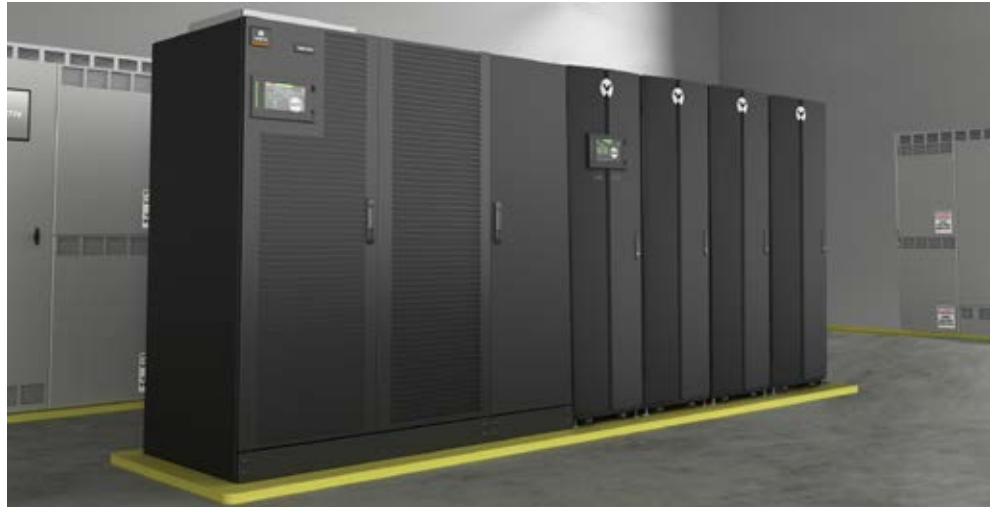
Vertiv™ Liebert® EXL S1 with Vertiv™ EnergyCore Batteries