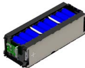
Vertiv™ Battery Module for 5 min EOL Runtime