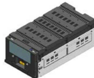
Vertiv™ Battery Module (7 min EOL Runtime)

Vertiv.com | Vertiv Headquarters, 505 N Cleveland Ave, Westerville, OH 43082, USA