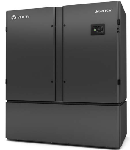
Vertiv™ Liebert® PCW chilled water unit