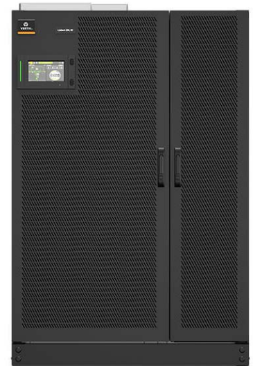
Vertiv™ Liebert® EXL S1 UPS