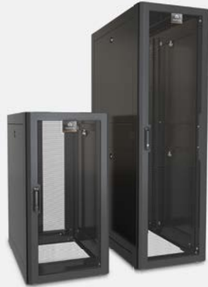
Vertiv™ DCE Rack