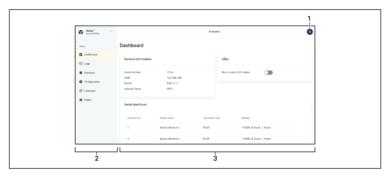
Table 2.1 Web UI Overview Descriptions