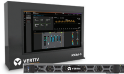
Liebert® iCOM™-S Panel and 1U Appliance