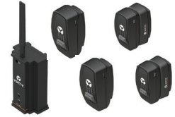
Wireless Gateway and Sensor for Liebert® iCOM™-S