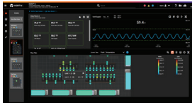
Liebert® iCOM™-S Software

Advanced thermal monitoring and control software that can be installed on a Vertiv™ appliance or on a customer provided personal computer or server.