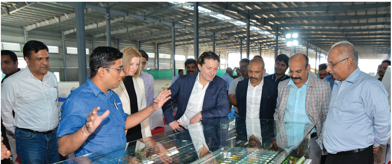
Visit of the CEO, Vertiv Manufacturing Facility, 2024. Chakan, Pune, India.

Vertiv respects and values diversity and strives to provide an inclusive work environment that is positive, productive, and characterized by respect. We also want it to be free of all forms of inappropriate workplace behavior, discrimination or harassment. Harassment includes offensive behavior that interferes with another's work environment or that would create an offensive, intimidating, or hostile work environment. Conduct will be considered harassment regardless of whether it is done physically or verbally and whether it is done in person or by other means (such as notes, social media postings, emails or text messages).