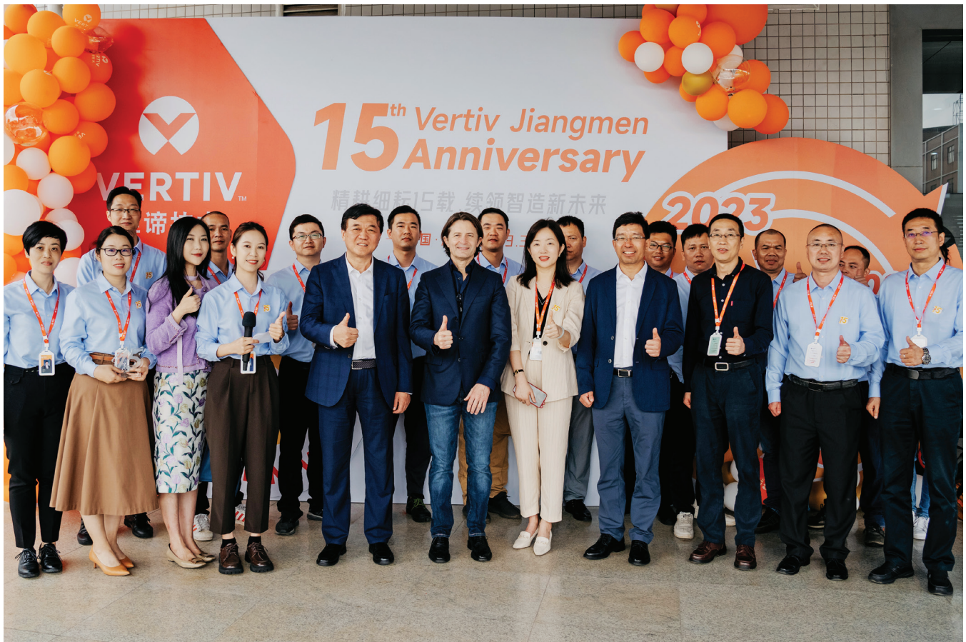
15th Anniversary of Vertiv Jiangmen. Jiangmen, China, 2023.

Vertiv values different ideas and points of view and seeks to sustain a culture of inclusion and diversity. It's one world, and one Vertiv, and as a result, we want our employees, regardless of who they are or where they are, to feel safe and valued such that they can grow to their fullest potential. Inclusion is a cornerstone of our business, because if everyone is involved, good decisions are made; and good decisions lead to better company performance. Accordingly, Vertiv is committed to promoting inclusion and equal opportunities for all with respect to hiring, terms of employment, mobility, training, compensation, and occupational health, without discrimination as to age, race, color, religion, creed, sex, marital status, sexual orientation, gender identity, genetic information, citizenship status, national origin, protected veteran status, political affiliation, disability, or any other status or characteristic protected by applicable law. This applies to employment decisions regarding recruiting, hiring, promotion, transfer, layoff, termination, compensation, benefits, training (including apprenticeship), classification, certification, testing, retention, referral, and other aspects of employment. Employment decisions must be based only upon the needs of Vertiv, the requirements of the position, and the qualifications of the individual, while simultaneously providing appropriate emphasis on the importance of diversity and hiring the best person for the position.