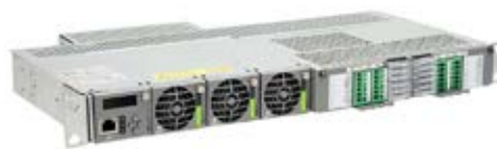
Vertiv™ NetSure™ 2100

High-density mini-sized DC power solutions for outside plant enclosure, central office or embedded applications.