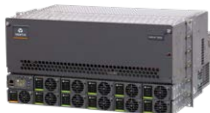
Vertiv™ NetSure™ 5100 with external distribution