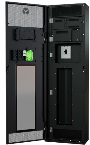
Figure 1. Vertiv™ Liebert® RXV (second access door view)

** 42 and 84 Poles Available in 208V only