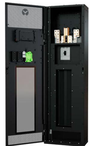
Figure 2. Vertiv™ Liebert® RXV (internal view - fingersafe option)