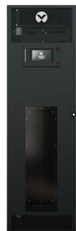
Figure 3. Vertiv™ Liebert® RXV with optional viewing window door