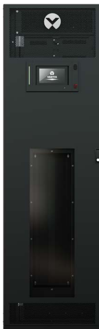
Vertiv™ Liebert® RXV

A navigation menu allows for easy system programming and equipment load management, along with the ability to import or export site-specific configurations to or from other units. The monitoring system offers voltage, current, power and energy metering with 0.5% accuracy, further integrating with your BMS systems to provide management of local and remote power distribution using automatic notifications of potential overloads, as well as local or remote emergency power-off.