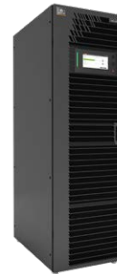
Liebert EXM™ UPS 10 - 250kVA