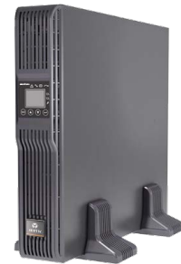
Liebert® GXT4™ UPS 500 - 10,000VA