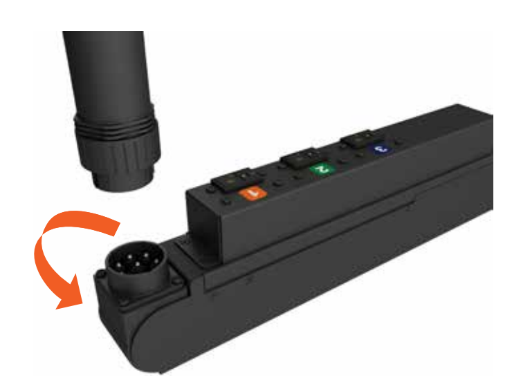
Vertiv rPDUs are available with selectable input power configuration and a detachable facility-side cable to enable standardization across multiple data centers in different regions or within a data center with a hybrid power architecture.

"I tell clients that 415V power is how they are going to get to the densities required by AI, and they should start planning for that now," Hubbard said. "These rPDUs are ideal for operators considering moving to 415V for the entire facility or adding 415V distribution to one section of the data center."