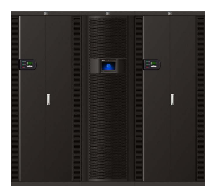
Distributed System (Max configuration: 2250A@400Vdc)