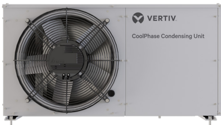
Vertiv™ CoolPhase Condensing Unit