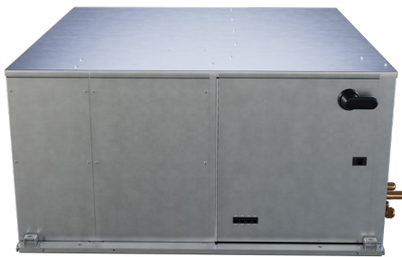
Vertiv™ CoolPhase Ceiling

It is designed to run 24/7/365, providing reliable temperature control even in extreme conditions, unlike typical comfort air conditioning systems. It meets the constant cooling demands of IT equipment, reducing the risk of overheating and equipment failure. Remote monitoring features allow personnel to oversee system performance and quickly address any issues, providing a stable environment for critical equipment.