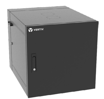
Vertiv™ Rack Wall Mount Rack