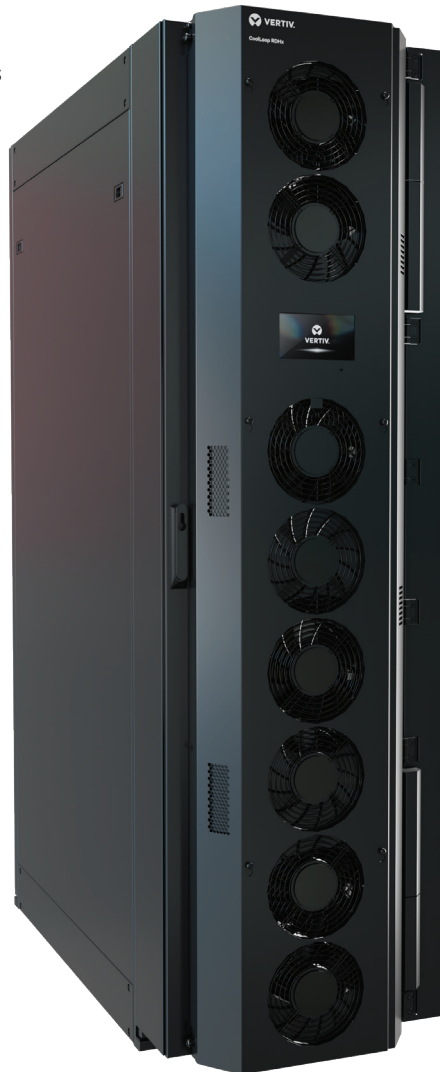
Vertiv™ CoolLoop RDHx available in both 600mm and 800mm configurations

The active module comes with built-in monitoring and control capabilities, enhancing the system's reliability, efficiency, and longevity, while allowing increased security and operational assurance.